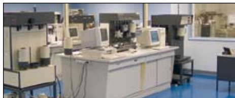
Quantachrome Instruments Application Laboratory.

Quantachrome is also recognized as an excellent resource for authoritative analysis of your samples in our fully equipped, state-of-the-art powder characterization laboratory.